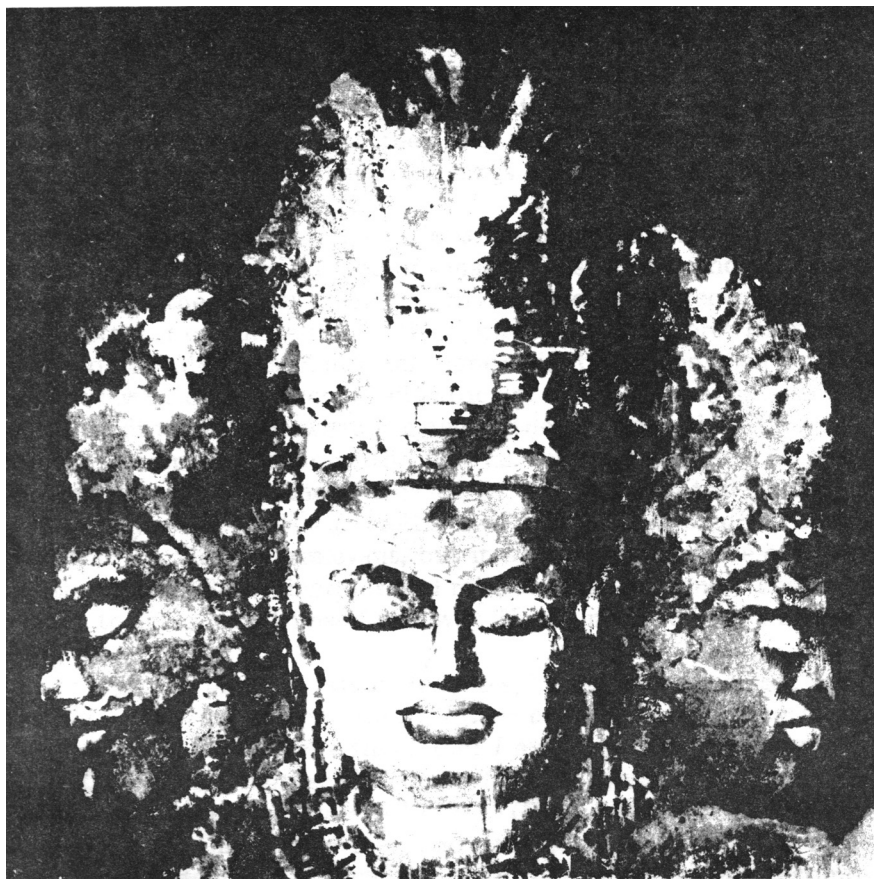
The Trimurti. A depiction of the Hindu Trinity: Brahma the Creator, Vishnu the Preserver and Mahesh the Destroyer

To some it may be a surprise to see the ancient drawing of the Hindu Trinity. The human conceptions about God go back to the time of Nimrod and Babylon. It is inconceivable how these ideas were later adopted by Christendom. Whosoever really recognizes what the pictures doctrinally express will appreciate the clarification from the Scriptures, which is most urgently needed.