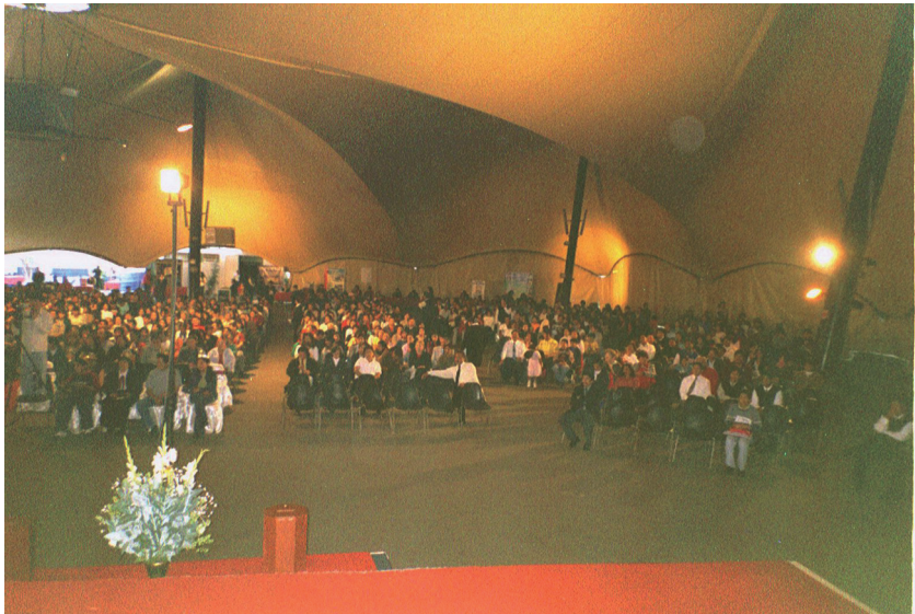
A meeting in Lima, Peru, October 2005.